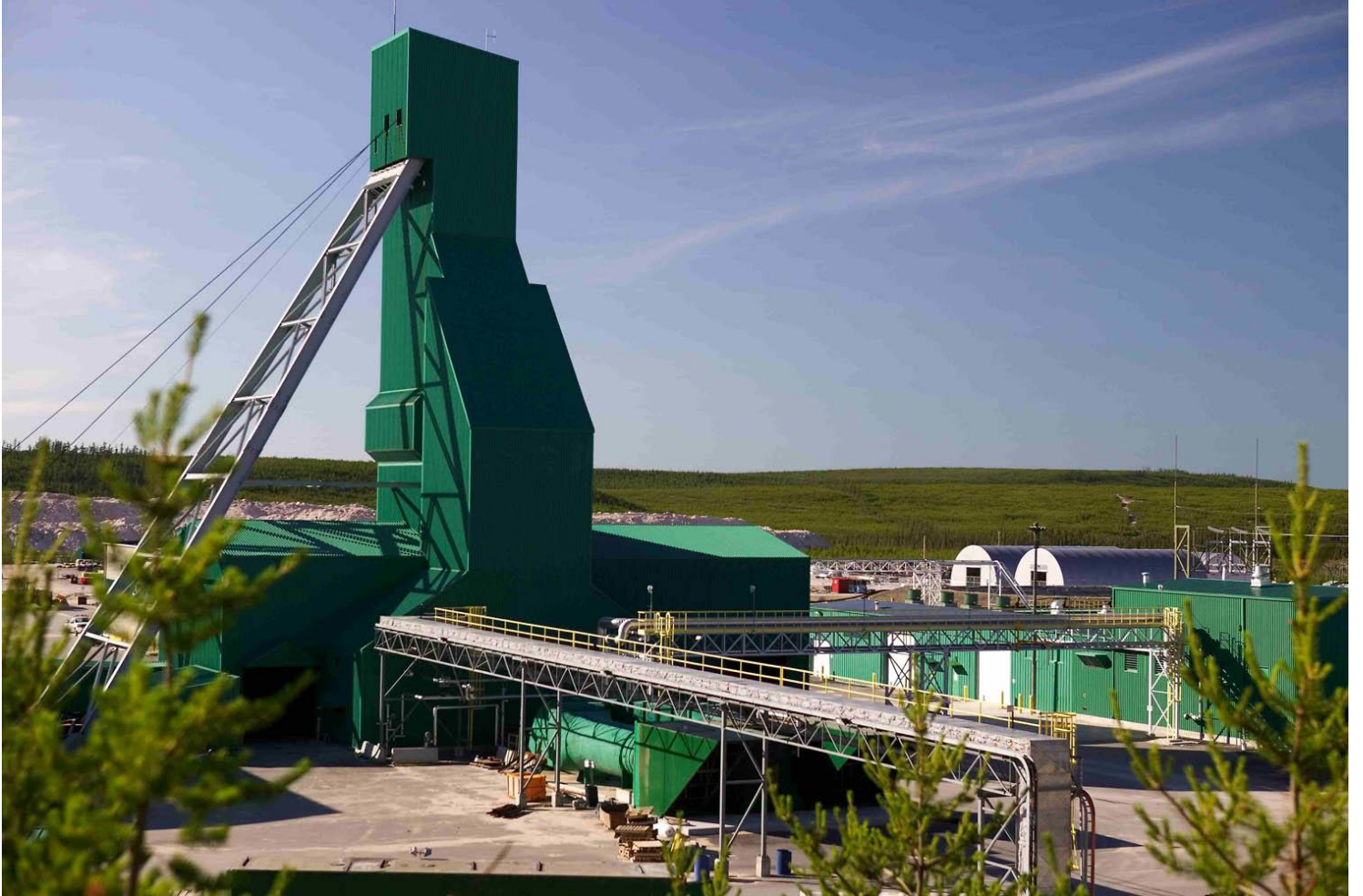
Cameco's McArthur River uranium mine in Saskatchewan.