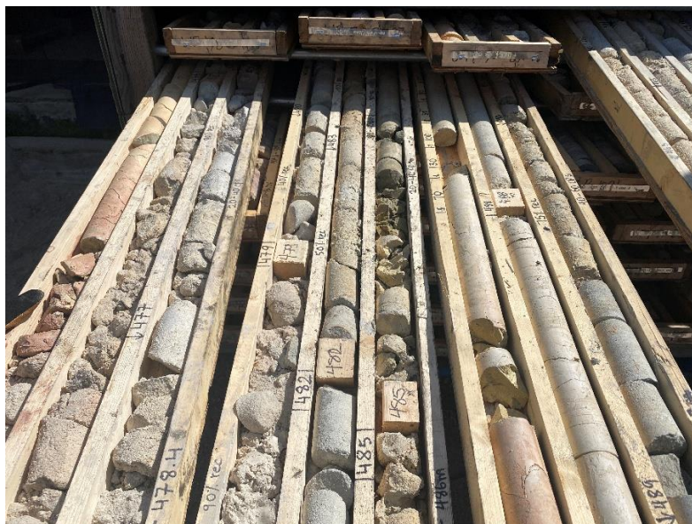
Uranium drill core

Orano McClean Lake Uranium Mine, Saskatchewan