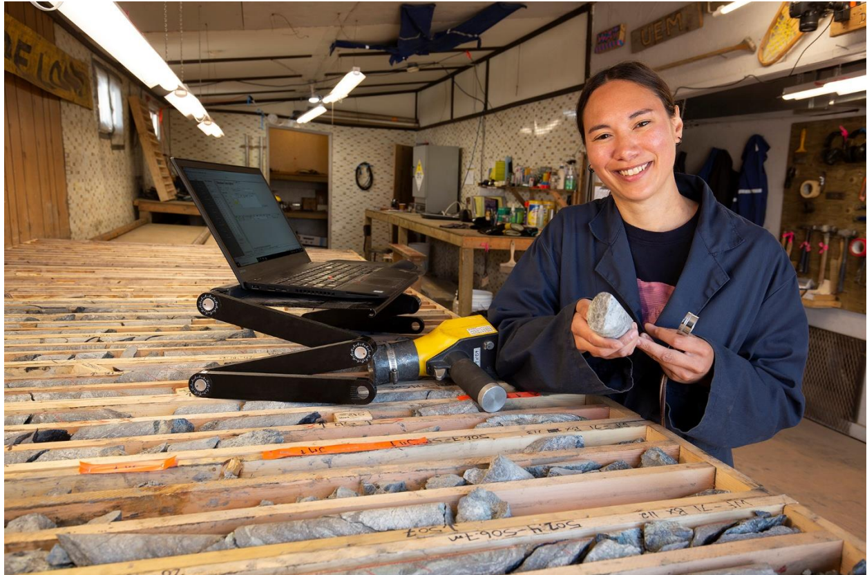
Uranium drill core Orano McClean Lake Uranium Mine, Saskatchewan

Additional exploration is needed to determine whether Nova Scotia's uranium deposits are economically viable and whether they could be extracted via solution mining.