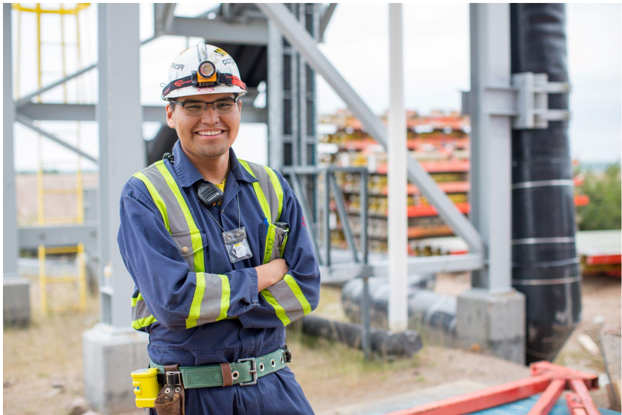
Mill Operator Orano McClean Lake Uranium Mine, Saskatchewan

We applaud the Government of Nova Scotia for acknowledging our industry’s tremendous potential to create more jobs and opportunity for Nova Scotians, and for committing to policy changes that will help the industry grow.